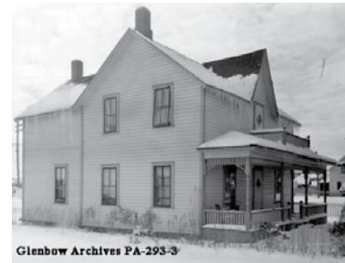
First General Hospital in Calgary, Alberta, 1920