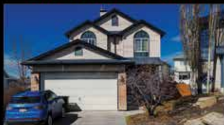
209 Tuscarora Place CONDITIONALLY SOLD