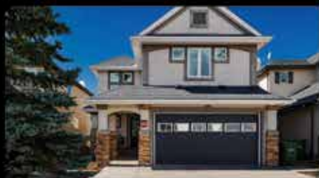
165 Tuscany Ridge Park CONDITIONALLY SOLD