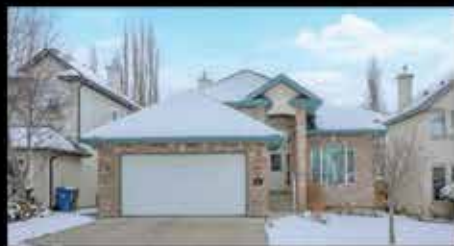
261 Tuscany Ridge Park CONDITIONALLY SOLD