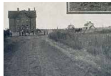
St. Dunstan's Calgary Indian Industrial School, Calgary, Alberta, 1905