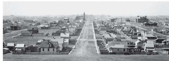
Bridgeland area, Calgary, Alberta, ca. 1912-1915