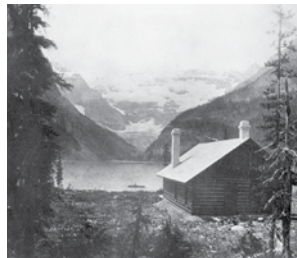
The first Lake Louise Chalet, Lake Louise, Alberta, ca. 1890-1893

We are proud to support the Scenic Acres, Tuscany and Silver Springs Communities!