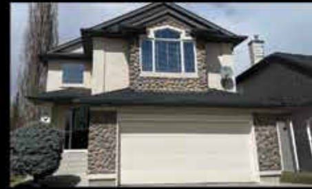
14 Tuscany Ravine Landing COMING SOON