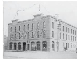
View of Alberta Hotel, Calgary, Alberta, 1893