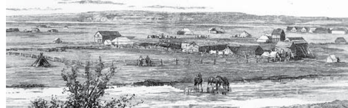
Calgary, Alberta, 1884

They also faced Residential Schools that isolated students from their culture and families under sometimes terrible conditions.