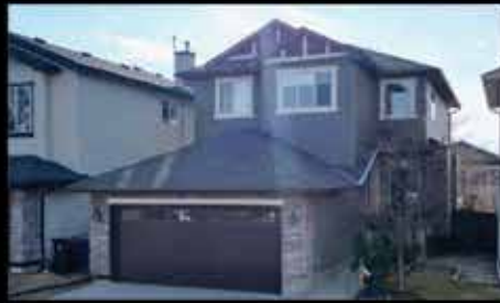
24 Tuscany Ravine View COMING SOON