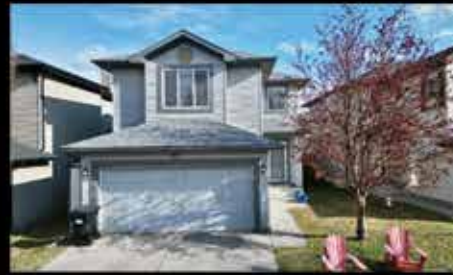
121 Tuscany Ravine Close COMING SOON