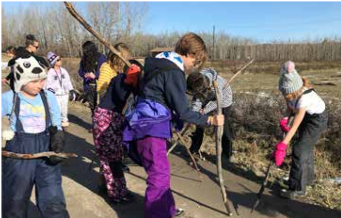
THE SILVER SPRINGS SPIRIT

Watch for more updates on our activities in and around Silver Springs in upcoming newsletters.