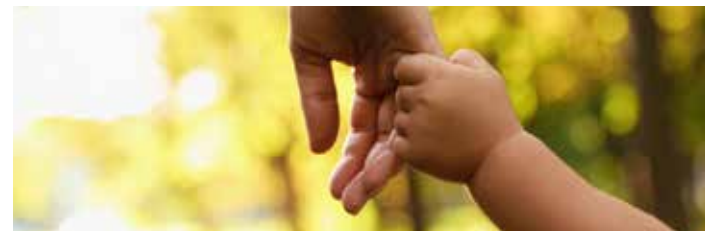
SUBURBAN JOURNALS www.suburbanjournals.ca