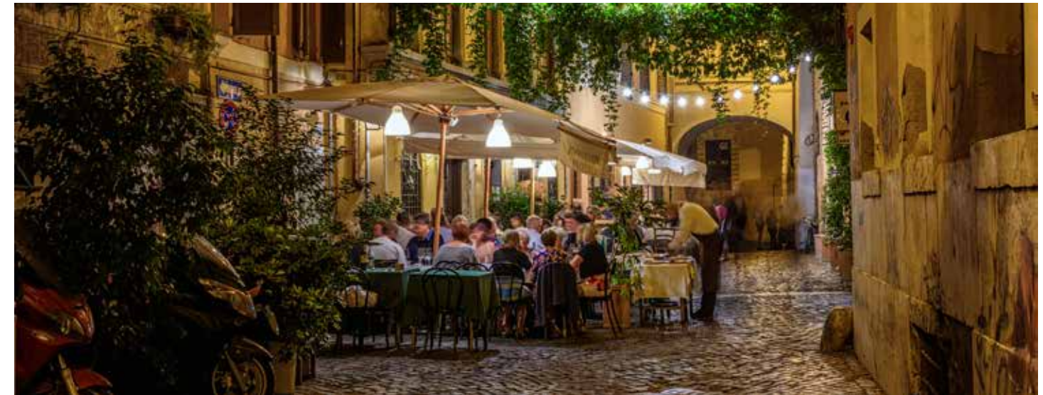
gather serve nourish