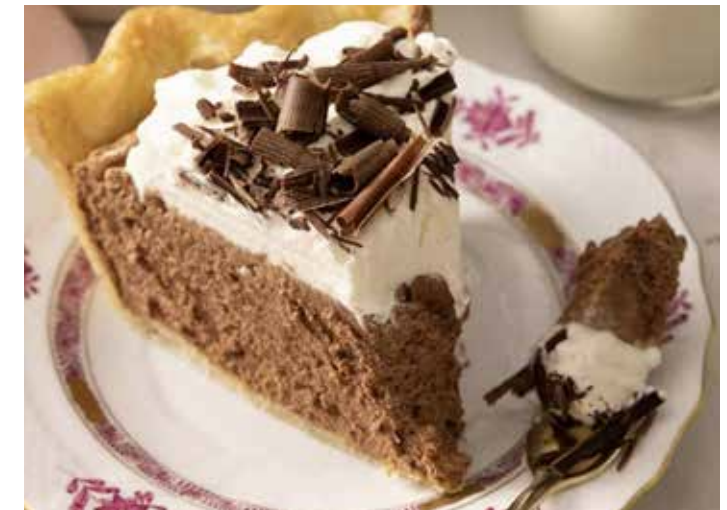
A Curated Kitchen is a new monthly feature from our chief editor. She looks forward to sharing her favourite recipes, hosting ideas, and a sundry of kitchen tips and tricks to enrich your times of gathering.